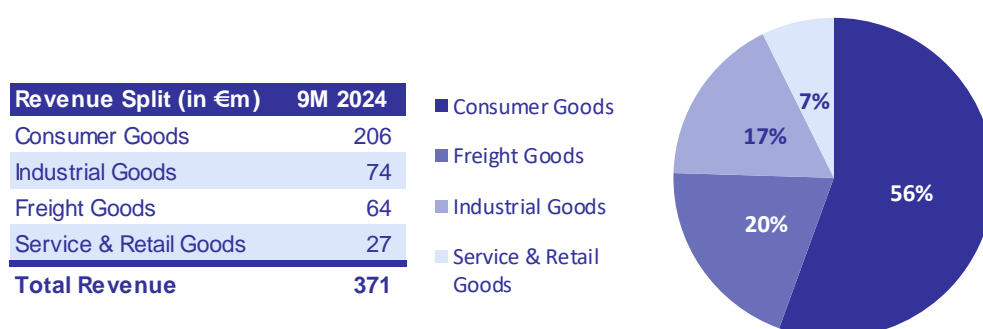
Figure 5: 9M revenue by segment