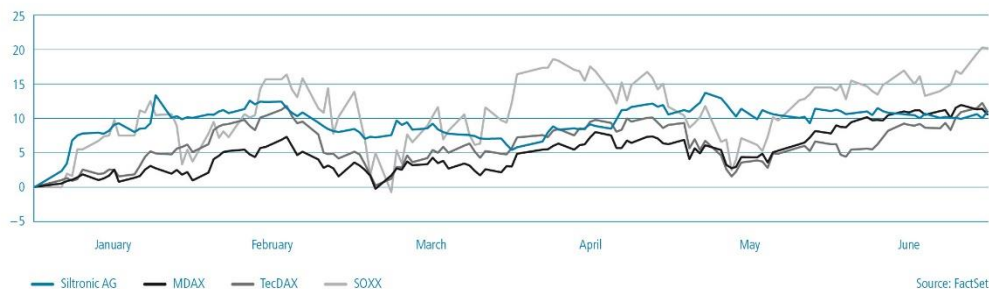
Performance of Siltronic shares vs. competitors 2021