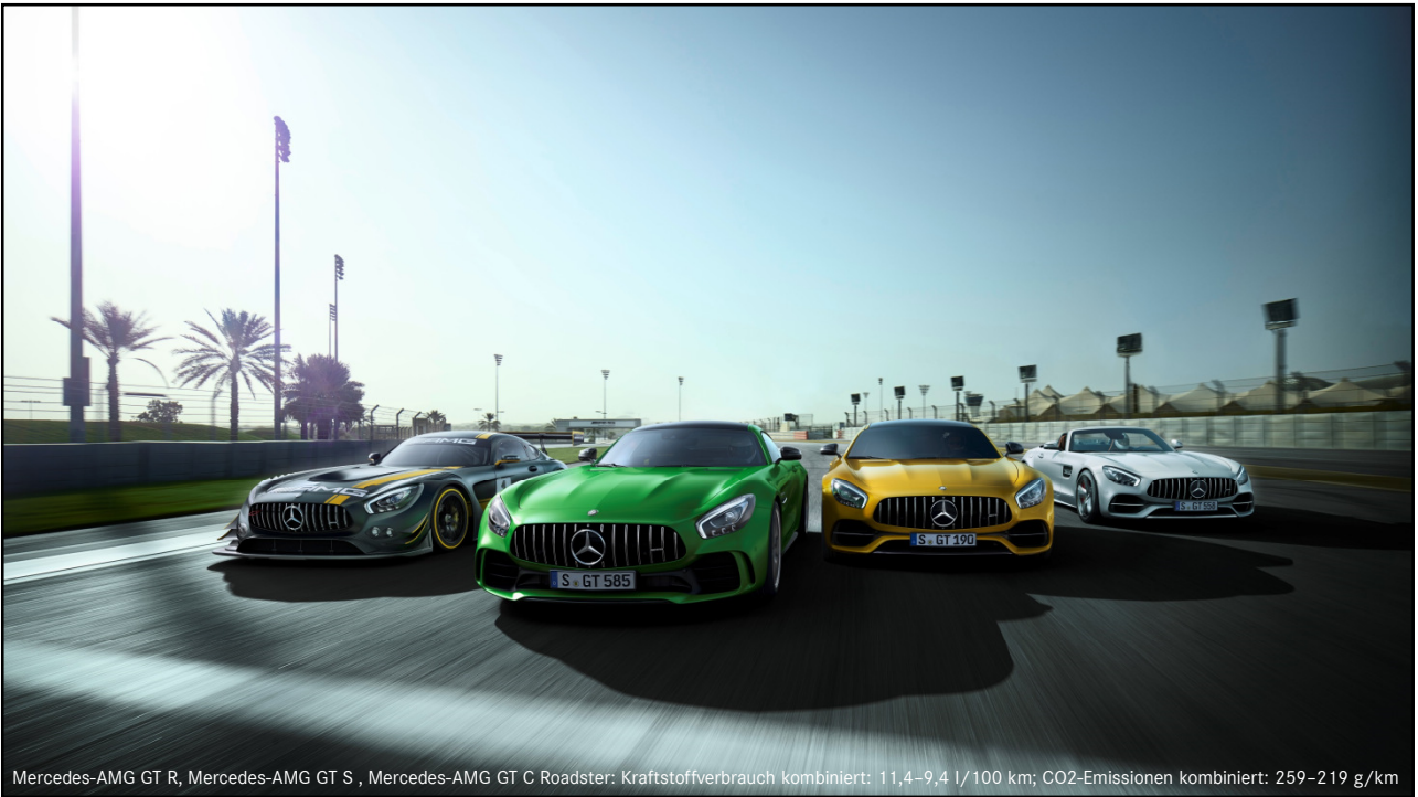
Mercedes-AMG GT R, Mercedes-AMG GT S, Mercedes-AMG GT C Roadster: Kraftstoffverbrauch kombiniert: 11,4–9,4 l/100 km; CO 2 -Emissionen kombiniert: 259–219 g/km