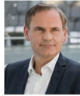
Dr. Oliver Blume Chairperson