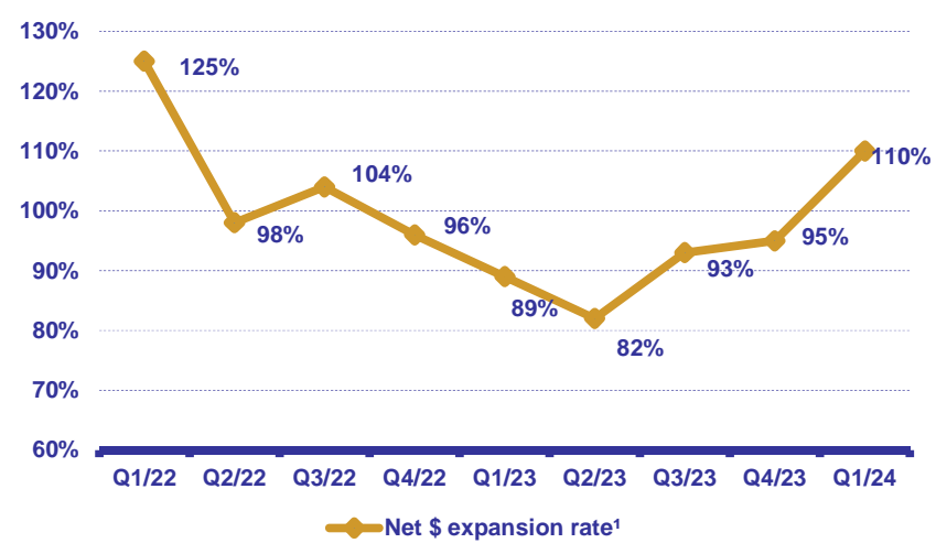
Figure 3: Net $ expansion rate positive again

<sup>1</sup> compares revenue generated by same customers at the BoP vs EoP