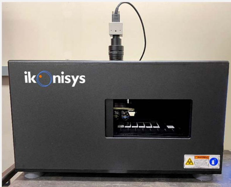
EXHIBIT 2: THE ICONISCOPE20

The entire scanning process is efficiently controlled by hardware and imaging algorithms. This allows slides to be scanned quickly while producing high quality, optimally focused and exposed images of cells that appear malignant. This automation of workflow significantly reduces dependence on the subjective skills of laboratory staff.