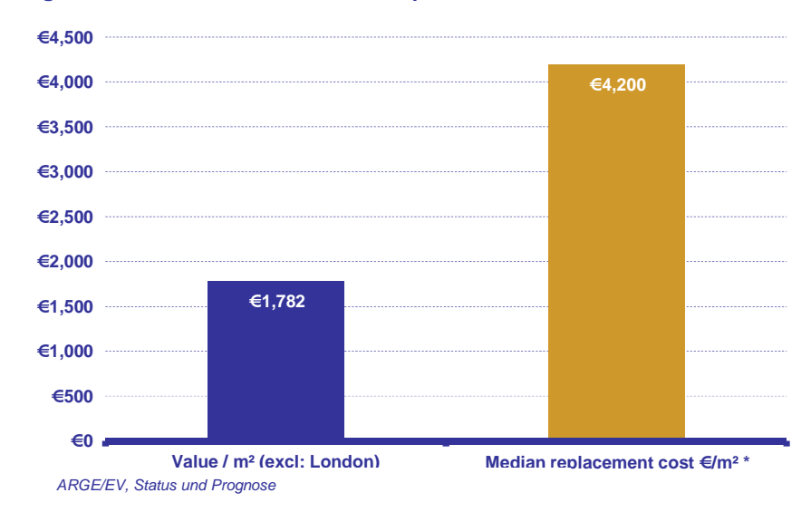
Figure 3: Portfolio values far below replacement costs