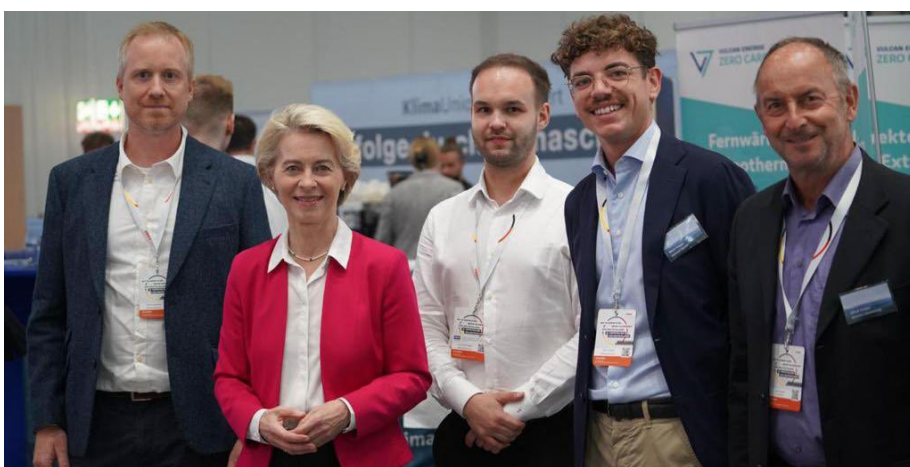
Ursula von der Leyen, President of the EU Commission, with members of the Vulcan team at the Christian Democratic Union (CDU) 35th Federal Party Congress in Hannover.

Over the European summer, Vulcan's government relations team hosted a number of politicians, media, suppliers and partners at site, and attended conferences and events around Germany. The events and visits are an important opportunity to build a greater understanding the Zero Carbon Lithium™ Project, exchange ideas and discuss ways to work together to deliver shared decarbonisation and energy security ambitions.