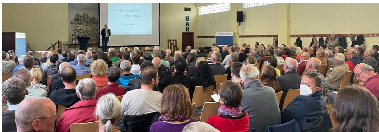
An information event in the Rhineland-Palatinate region, attended by approximately 200 residents.

During the Quarter, Vulcan's community team attended four information events and city council meetings hosted by the local community including Haßloch, Gernsheim, Steinweiler and Herxheim in the Rhineland-Palatinate region.