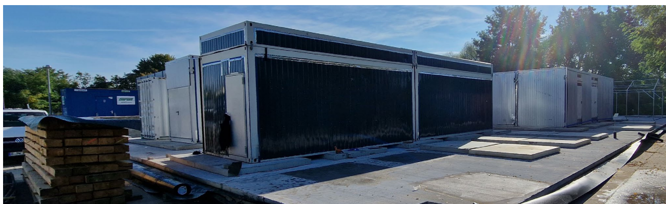
Onsite works for Vulcan's Sorption-Demo Plant.

During the period, onsite works for Vulcan's Sorption Demo Plant in Rheinland-Pfalz, Germany commenced, following offsite fabrication which has been ongoing since March 2022. The plant is on the premises of Energie Südwest AG (ESW), the local energy utility, following the completion of FEED studies, mobilisation and delivery of key components. Vulcan's Sorption Demo Plant will receive the geothermal brine, under a brine offtake agreement, from the adjacent Landau geothermal plant operated by geox GmbH. The Sorption Demo Plant will be used to train Vulcan's operations team in a pre-commercial setting, prior to planned commercial production from separate plants in 2025.