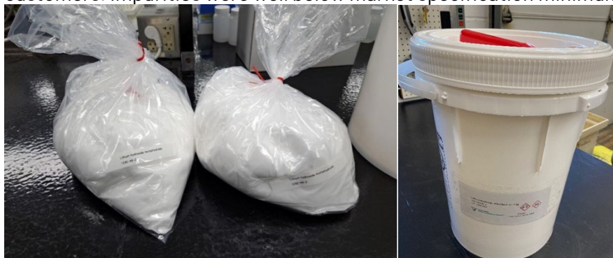
Vulcan's highest grade, lowest impurity lithium hydroxide (LiOH) to date from its Pilot Plant.

Subsequent to the end of the Quarter, Vulcan announced that it had successfully produced the highest grade, lowest impurity lithium hydroxide (LiOH) to date from its Pilot Plant. The lithium hydroxide was produced from Vulcan's sorption Pilot Plant, located at Vulcan's commercial geothermal renewable energy plant in the URVBF in Germany, with downstream electrolysis processing offsite, as per Vulcan's planned commercial Zero Carbon Lithium™ Project. The latest material graded 57.1% LiOH, easily exceeding the best-on-market battery grade specification of 56.5% LiOH required from offtake customers. Impurities were well below market specification minimums.